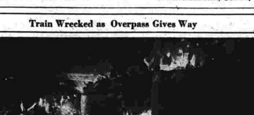
Score of rescue workers swarm over wreckage of Pennsylvania railroad commuter train at Woodbridge, N. J. An overpass gave way beneath the high speed train. Note on car suspended over trestle at left.